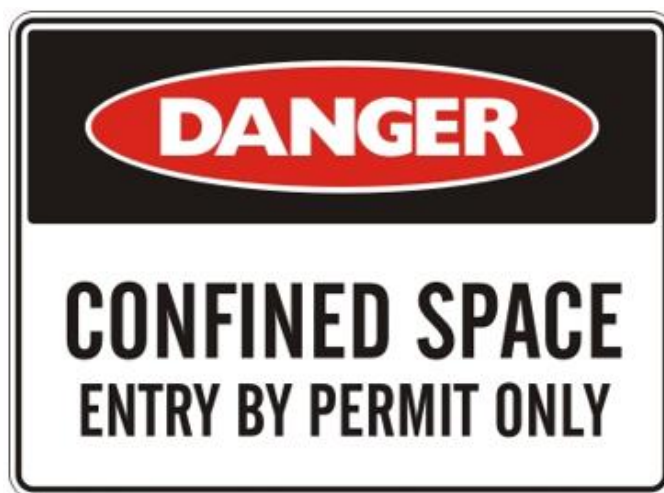
Figure 2: Sample Confined Space sign

Confined space signs shall comply with the requirements of OHS Regulations and all signs shall comply with AS 1319.